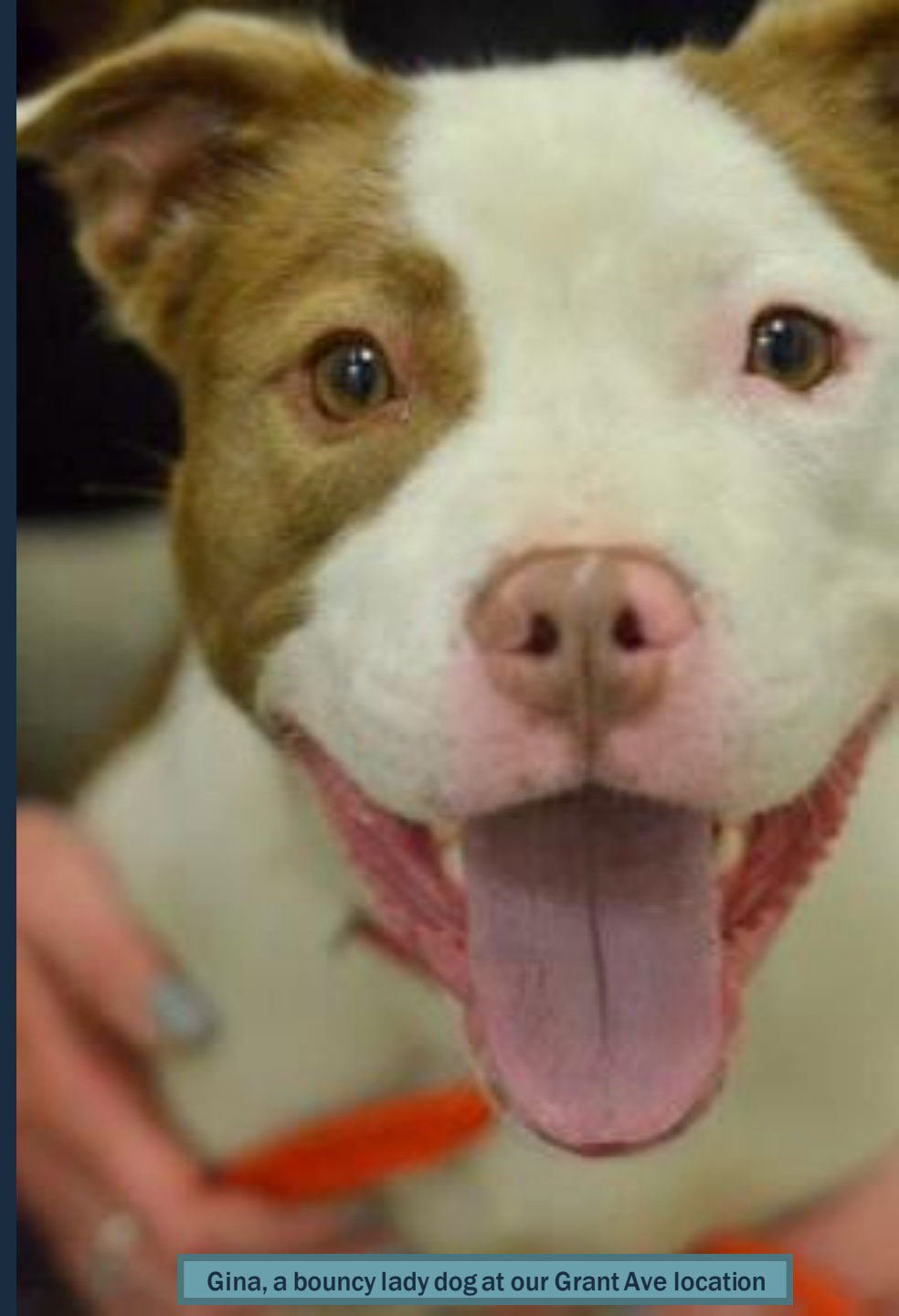
Gina, a bouncy lady dog at our Grant Ave location