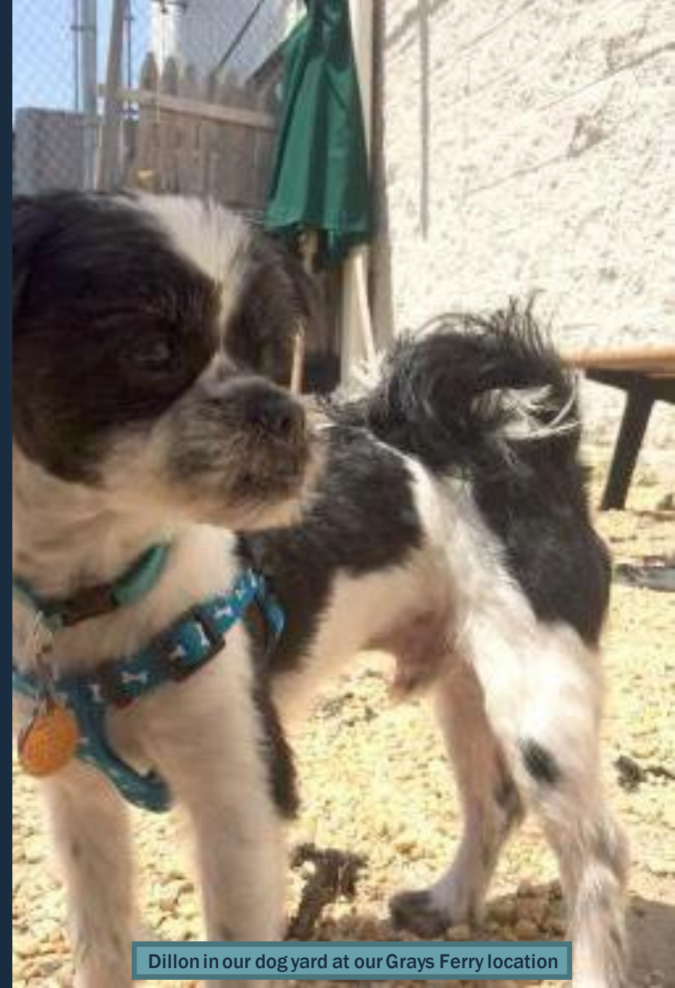
Dillon in our dog yard at our Grays Ferry location