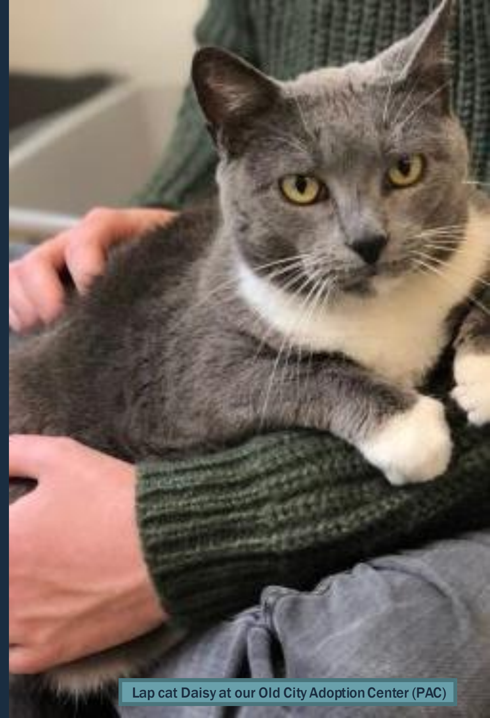
Lap cat Daisy at our Old City Adoption Center (PAC)