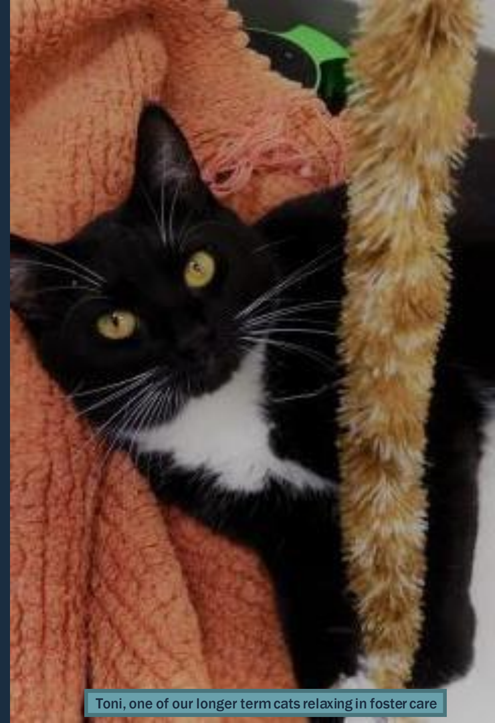
Toni, one of our longer term cats relaxing in foster care