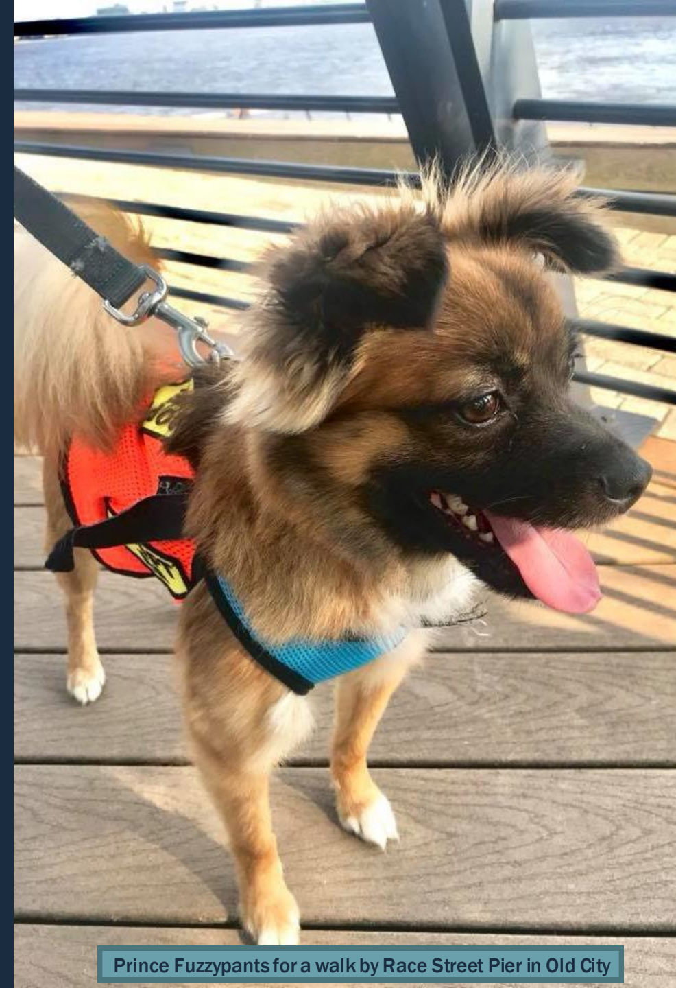
Prince Fuzzypants for a walk by Race Street Pier in Old City